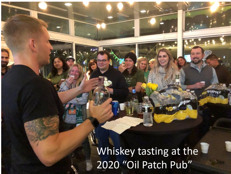
Whiskey tasting at the 2020 "Oil Patch Pub"